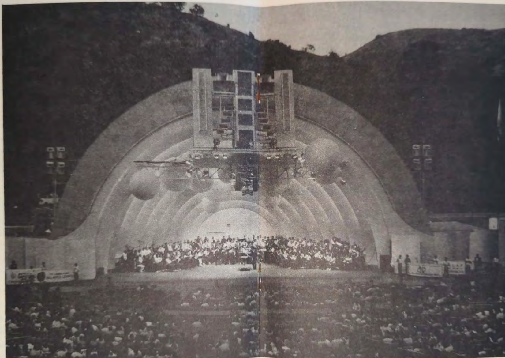
Montrose Symphonic Band in concert June 29, 1984 at the Hollywood Bowl combined with the Oak Lawn Symphonic Band of Dallas; The Minnesota Freedom Band; The Desert Overture of Phoenix; D.C.'s Different Drummers of Washington, D.C.; The Great American Yankee Freedom Band of Los Angeles;